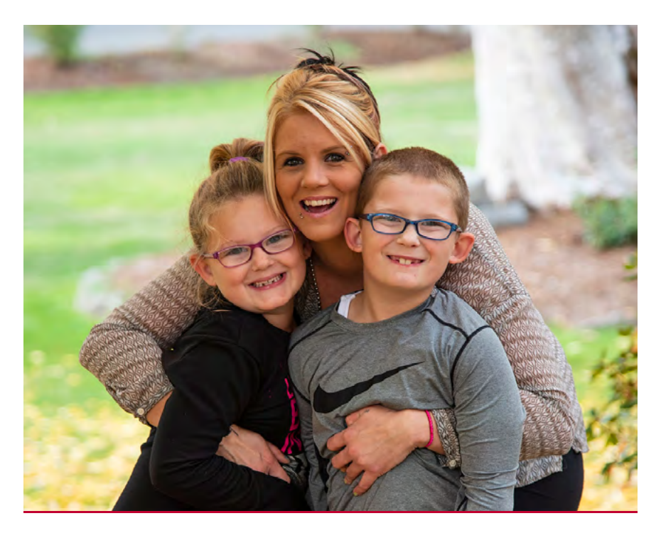
To learn more and get updates about The Journey Home, please visit our website at www.ugmportland.org/journeyhome

This past December we marked a significant milestone with the completion of framing. We are so thankful for the support of this project that will allow women and children to end cycles of addiction, poverty and abuse.